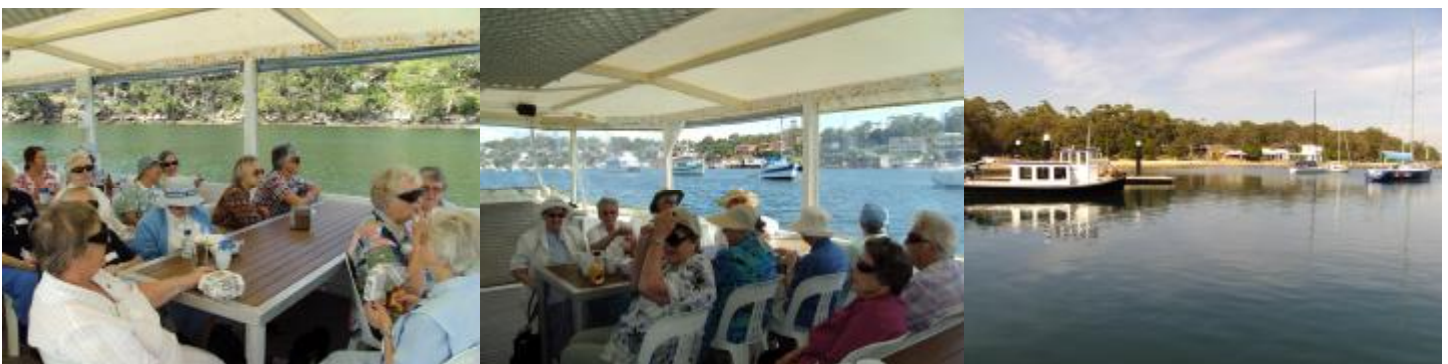
ENJOYING THE PORT HACKING CRUISE ON A BEAUTIFUL DAY IN MARCH!