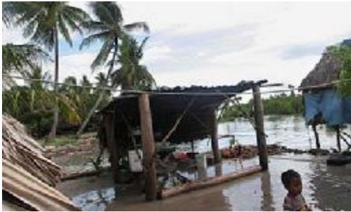
Photo showing a Kiribati island ravaged by the rising tide