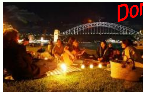
2007: Sydney-siders spending Earth Hour enjoying a candlelit picnic beneath the unusually dark city sky!

Feedback from last year showed that many people found Earth Hour to be a great opportunity to stop and share time with the people around them, without the distractions of televisions or radios. We'd love to hear what you took away from Earth Hour 2008, so if you found yourself to be a special part of this global event, please send us ( clrinsw@ozemail.com.au ) a short account of what you did so we can share your stories with the rest of the community!